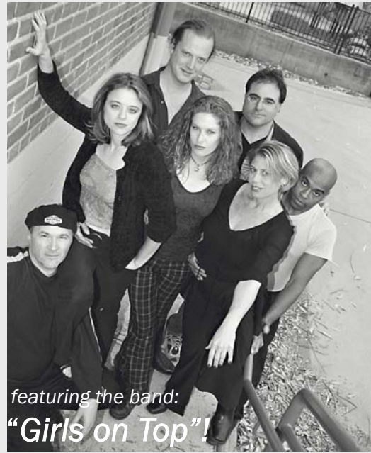
featuring the band: "Girls on Top"!

(If you'd like to contribute to the silent auction, please let us know.)