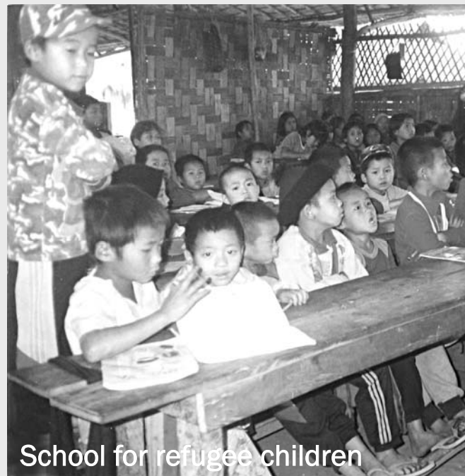
School for refugee children