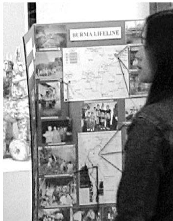
A visitor takes in a Burma Lifeline display at the Boulder Public Library