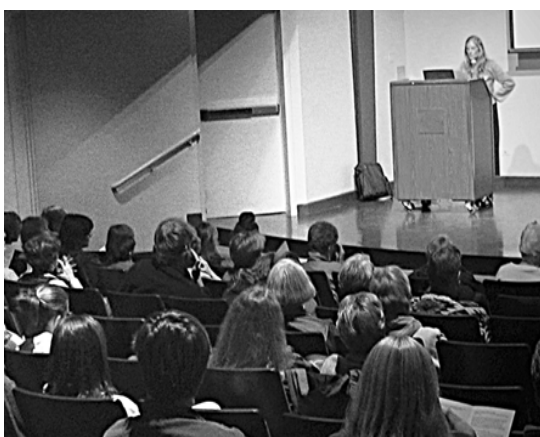
Guests attending Burma Lifeline presentations at the Boulder Public Library, April 9th 2005