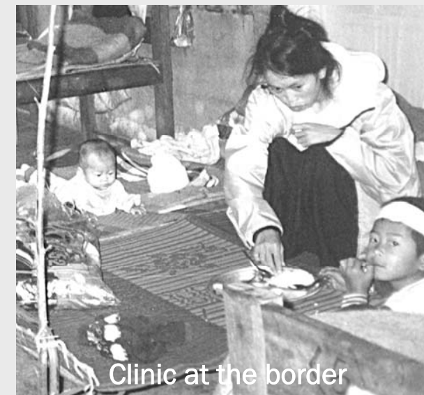
Clinic at the border

• Recently had four of our Burma Lifeline people (two directors and two volunteers) visit the Thai-Burma border regions, at their own expense. They have seen for themselves how great the needs of the refugees are and how much Burma Lifeline is accomplishing with your generous help. Without your support we could not continue our efforts.